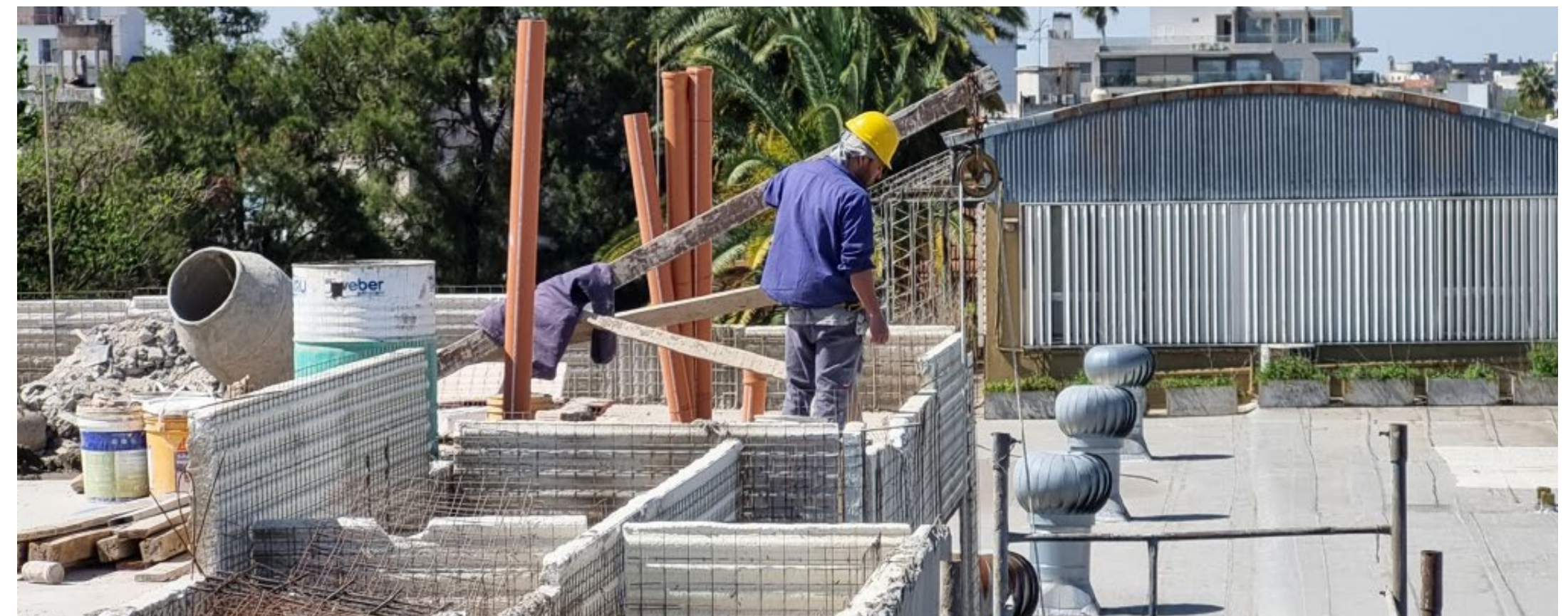
Alvear 1050 - Eco-Sustainable Residential Complex