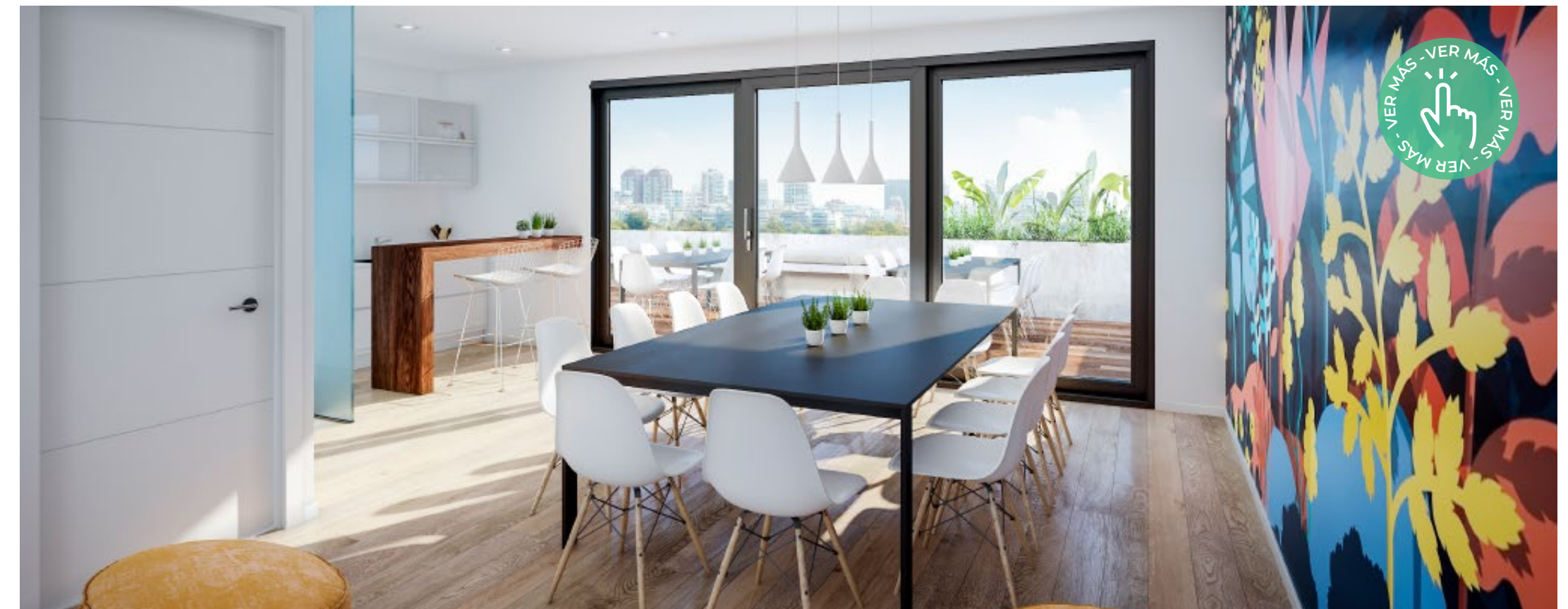
Allegra EcoSmart - Project Development, Construction Management