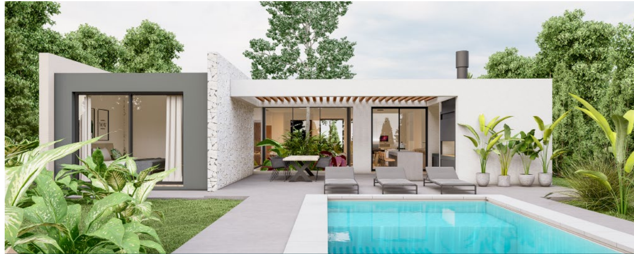
Nativo - Home Models at Buenos Aires, Argentina