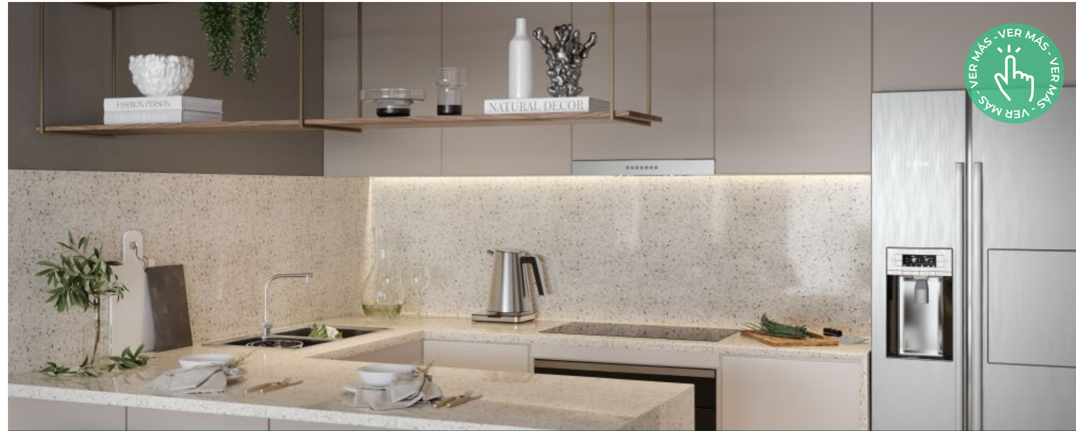
Sommar - Project Development, Rendering, MEP & Technical Plans