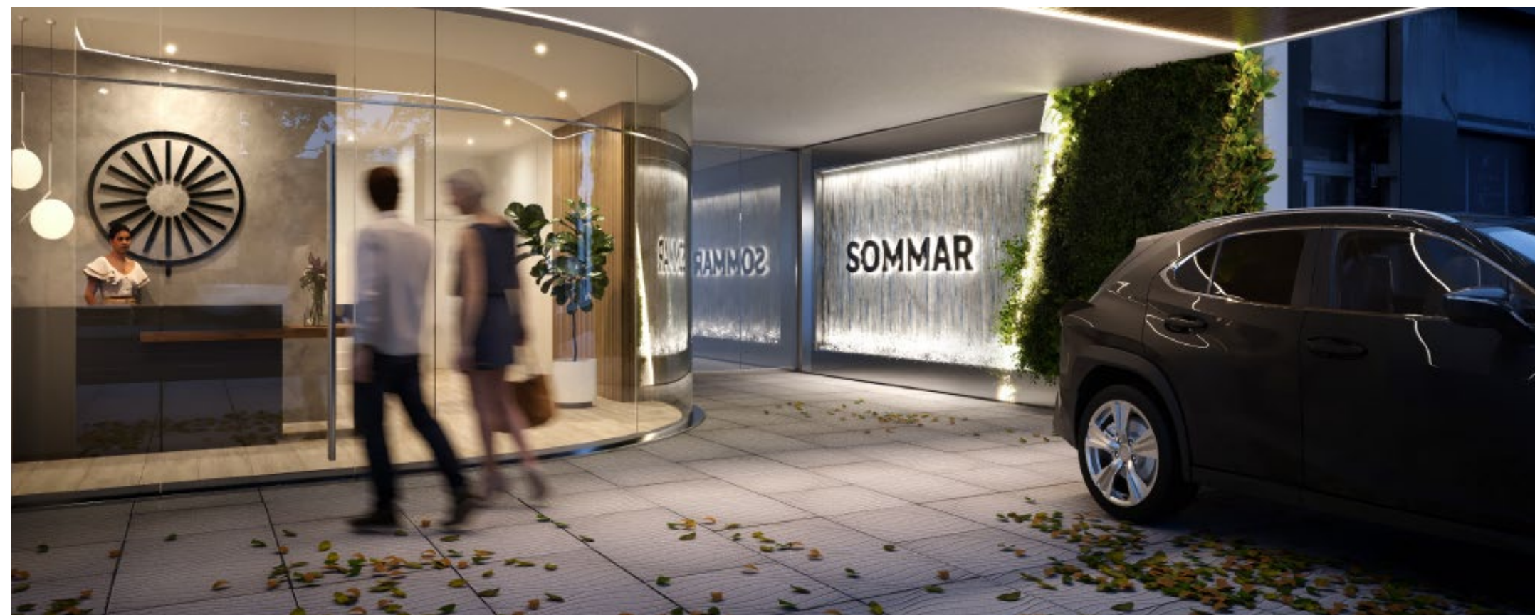
Sommar - 7-story building project at Buenos Aires, Argentina