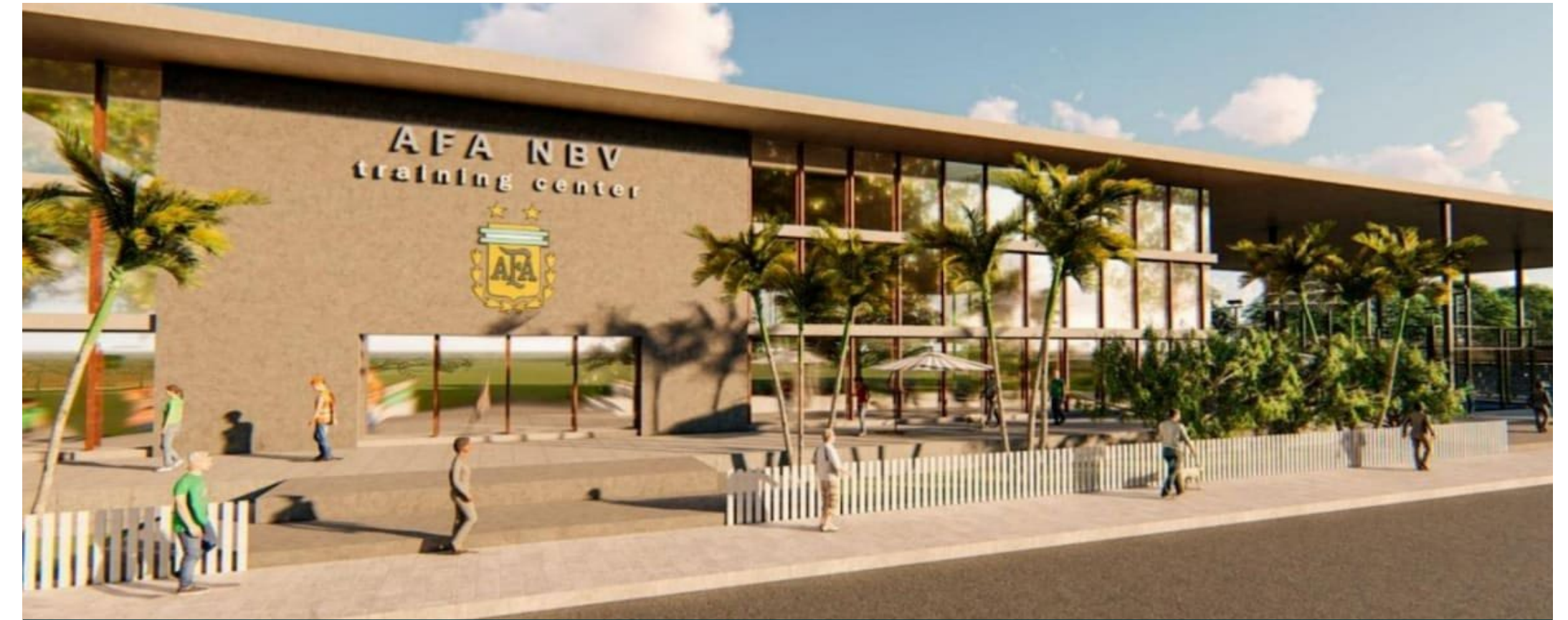
AFA Training Facility Miami, USA - Technical Documentation