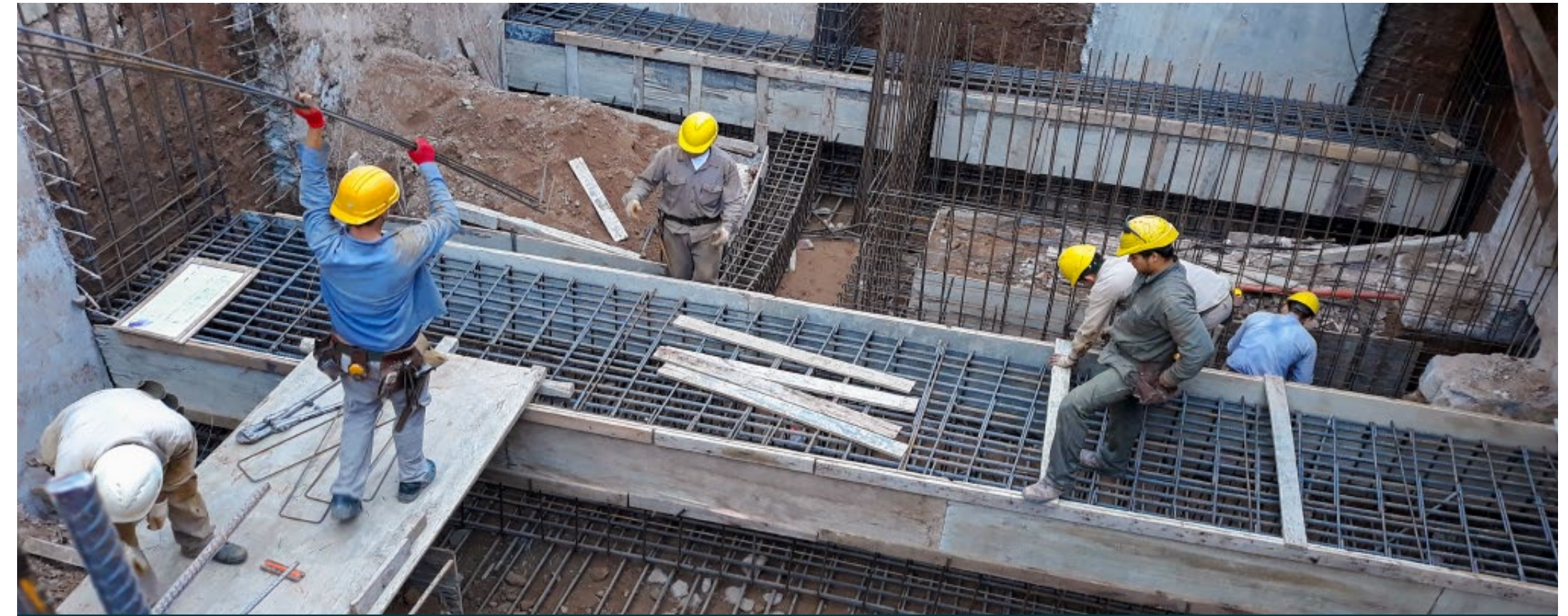
Allegra - Eco-Sustainable 9-story building at Buenos Aires

Construction management is essential to ensure the project is executed as planned. We supervise each phase of construction regularly, setting timelines, payment schedules, and coordinating progress to ensure the project is completed on time and within scope.