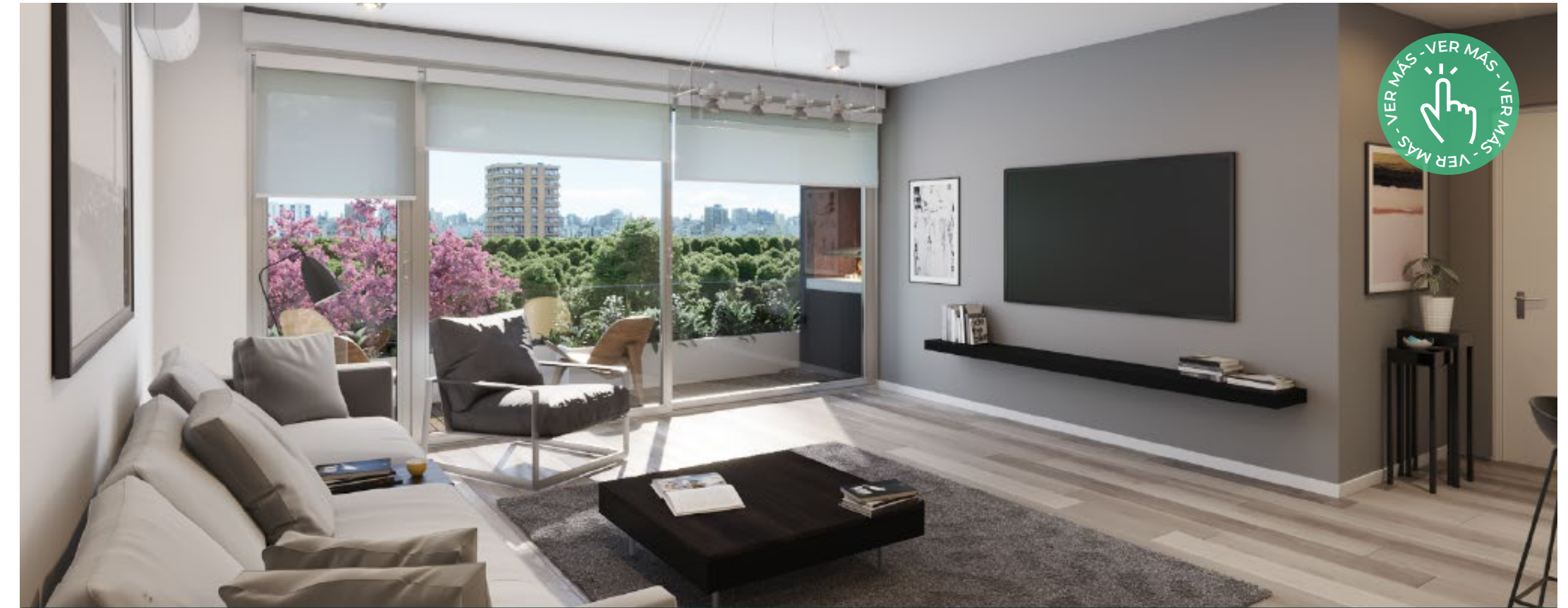
Alvear 1050 - Project Development, Construction Management

We are committed to finding comprehensive solutions and concrete responses to the challenges presented, always giving the client's vision a leading role in creative decisions.